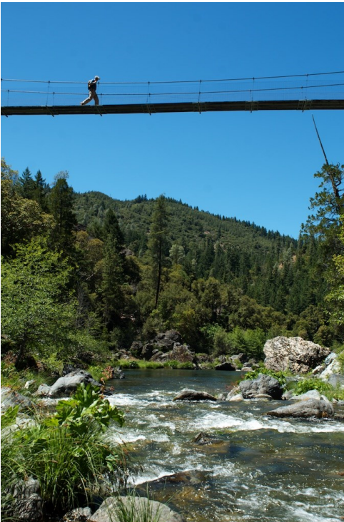
Hayfork Creek

Northwest California is one of the most beautiful places on earth. Stretching from Humboldt County's fog-shrouded redwood forests to the sunny oak woodlands and grasslands of Mendocino, this breathtaking region reaches up to the peaks of the Trinity Alps Wilderness and across the turquoise waters of the Wild & Scenic Smith River.