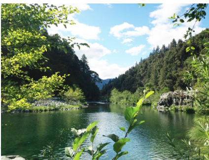
South Fork Trinity River, photo Jeff Morris

How will it help fish? The legislation would protect the watersheds, headwaters, rivers and streams that fish rely on, preserving the clean, cold water they need to survive. The bill also contains provisions to restore water quality and aquatic habitat within the South Fork Trinity River watershed, a vital fishery.