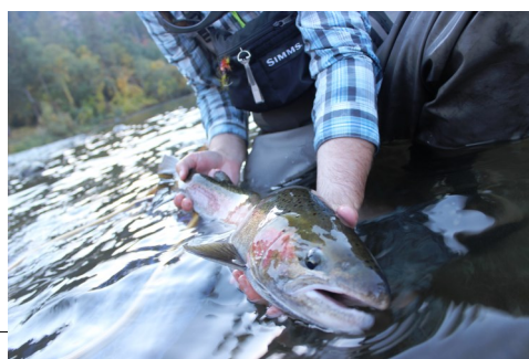
Wild Steelhead